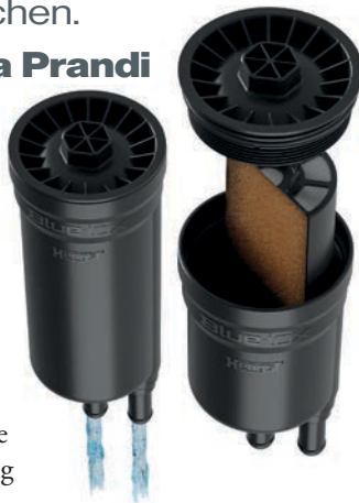
Hengst ion exchanger