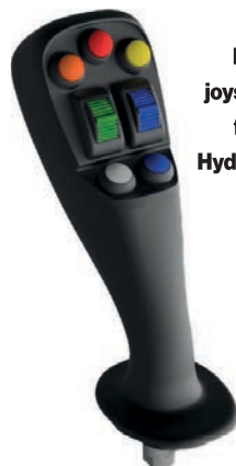
MHC joystick from Hydreco